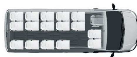
City bus / 16+1+1